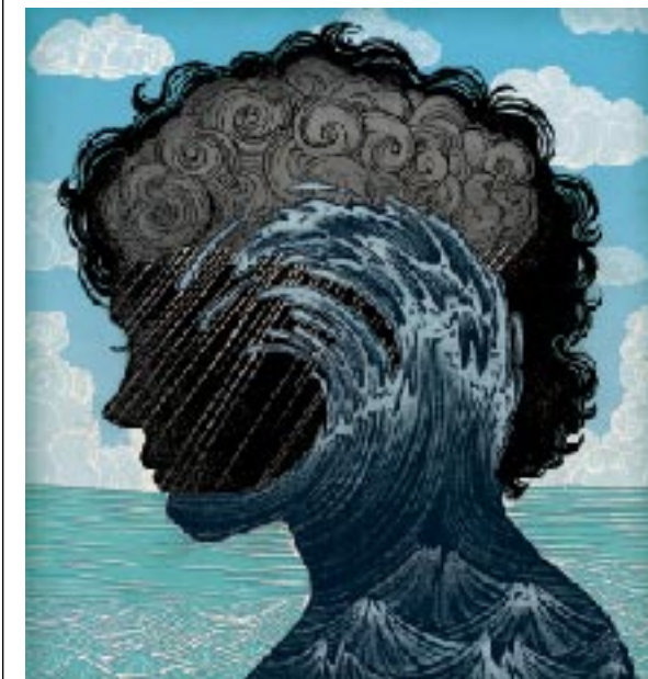
FEAR by Yuko Shimizu

The fire of expectation, it seems, somehow sears the memory