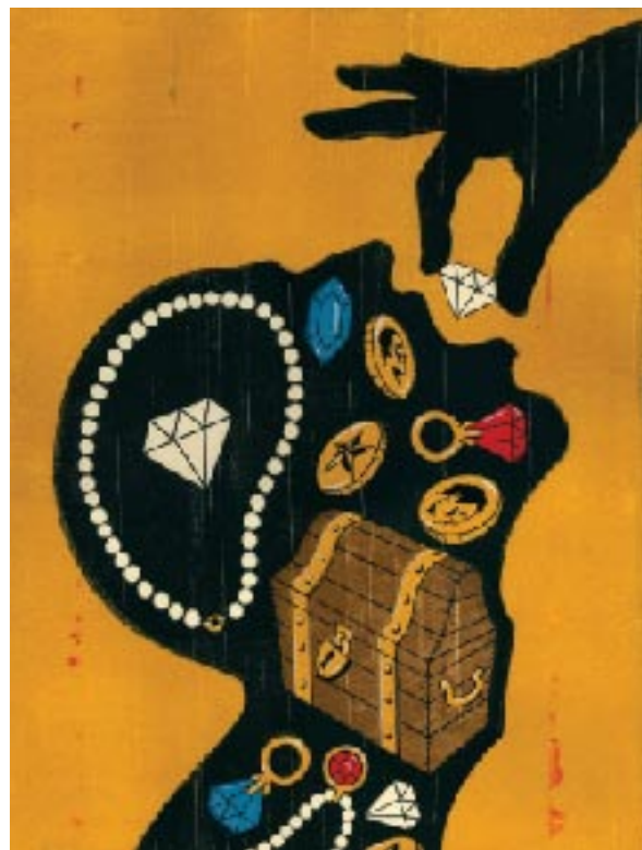
GREED by Daniel Bejar

DEEP IN THE CENTER OF YOUR BRAIN, level with the top of your ears, lies a small, almond-shaped knob of tissue called the amygdala (ah-mig-dah-lah). When you confront a potential risk, this part of your reflexive brain acts as an alarm system—shooting signals up to the reflective brain like warning flares. (There are two amygdalas, one on each side of your brain.)